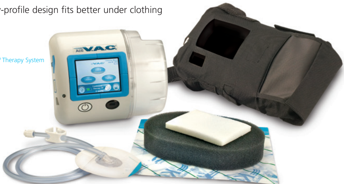
ActiV.A.C.® Therapy System